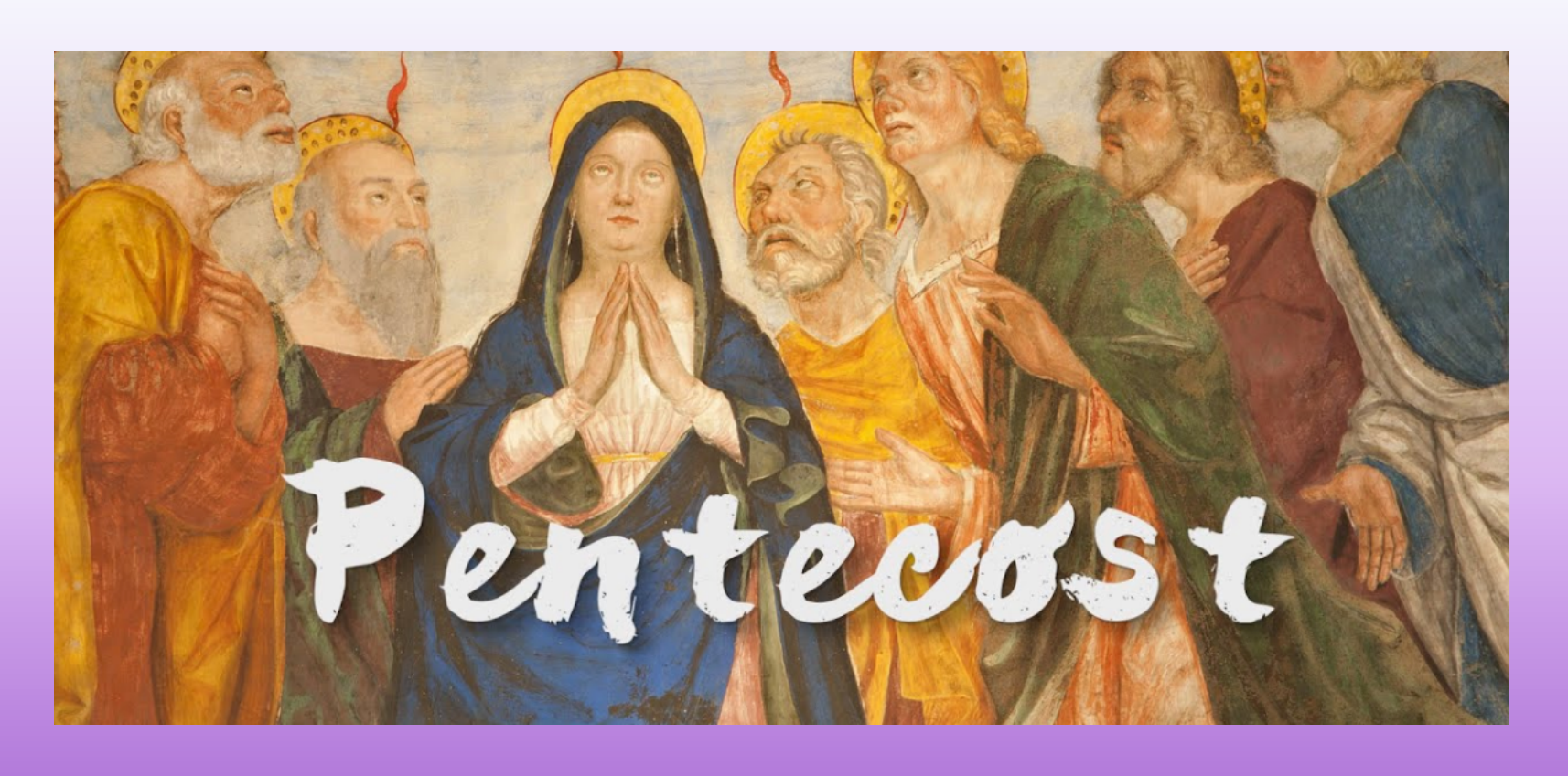
"When the day of Pentecost came, they were all together in one place.

Suddenly, a sound like the blowing of a violent wind came from heaven and filled the whole house where they were sitting.