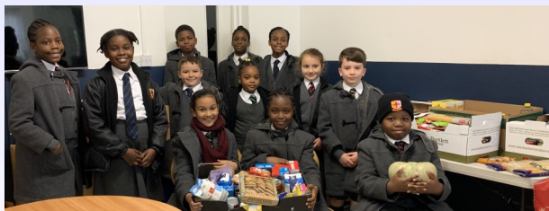
The Chaplaincy Team taking the Harvest Gifts to the Trussell Trust Food Bank.